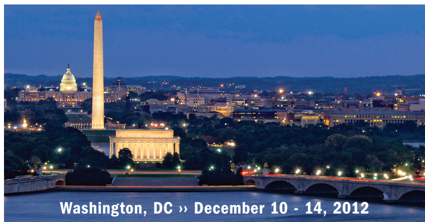
Washington, DC » December 10 - 14, 2012