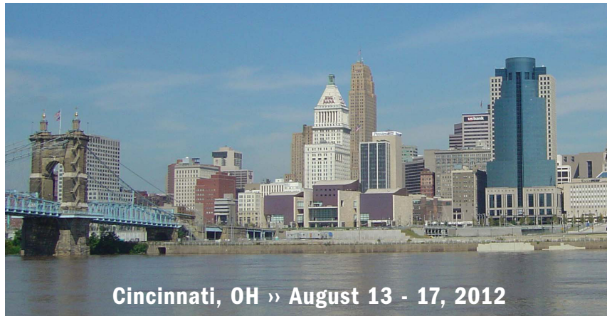
Cincinnati, OH » August 13 - 17, 2012